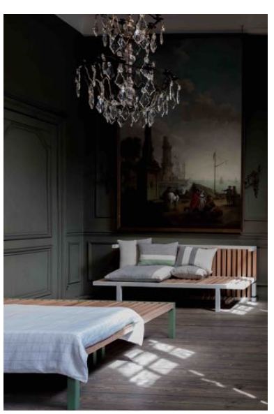
Een Meubel is ook een Huis Curated by Katrien Vandemarliere